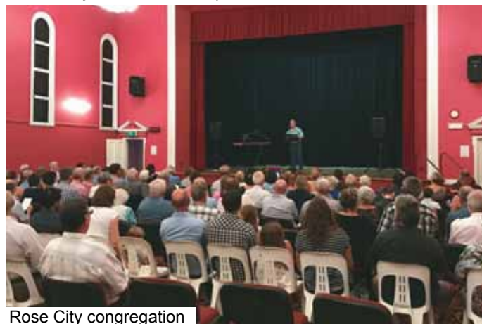
Rose City congregation

Please pray for us in Warwick—at the new Rose City Presbyterian Church —as Paul commanded the Thessalonians to pray: "That the message of the Lord may spread rapidly and be honoured, just as it was with you." 2 Thessalonians 3:1