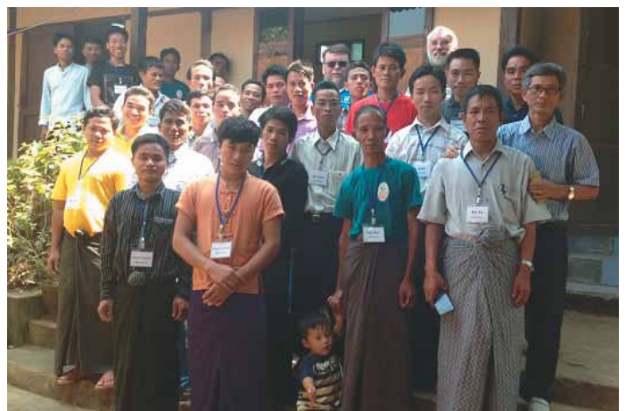
Reformed Bible Institute Pastors and Students at Myanmar

own people in Myanmar, and the Glory of God. Please pray for those who attended the studies and thank our Lord for these opportunities.