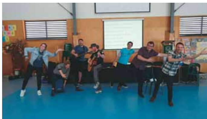
The Parable of the Sower (scattering seeds)

Hosting the team of QTC students was of benefit to the two partner churches in Gympie. Members of both churches appreciated spending time with the students, and were encouraged by their gospel focus and enthusiasm for Christian ministry.