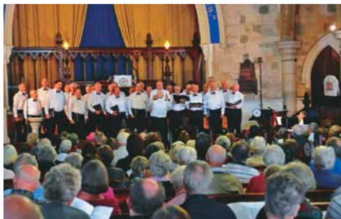
Brisbane Festival Male Voice Praise