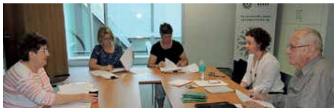
Making final preparations for Christmas Connections Morning tea